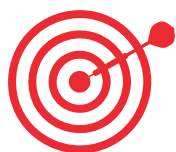
Focusing on your goals

Your approach to investment will vary depending on what you are looking to achieve.